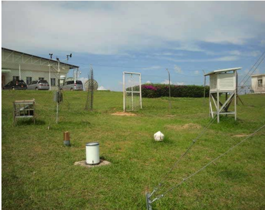
Entebbe Meteorology Centre

Presented at a Workshop at Jinja Nile Resort Hotel